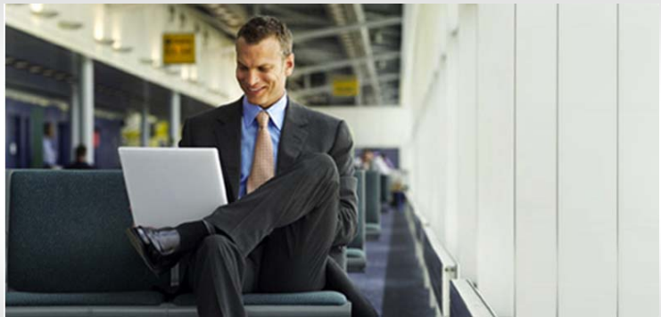
Any location, any client -- your desktop the way you left it